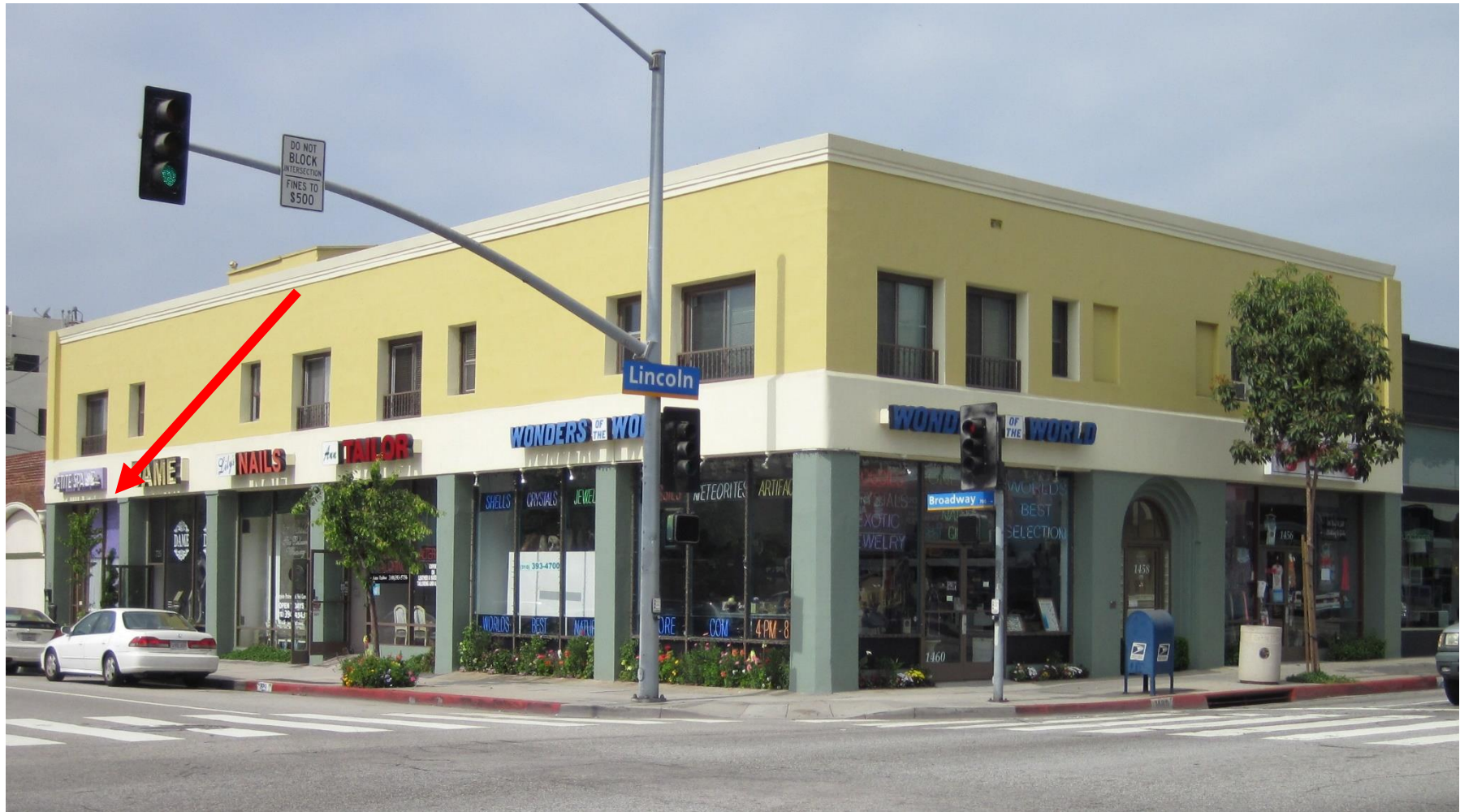
NW Corner of Lincoln & Broadway